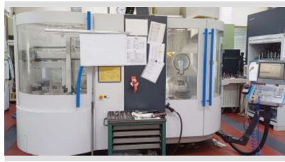
MIKRON UCP 600 VARIO 5-axis machining center