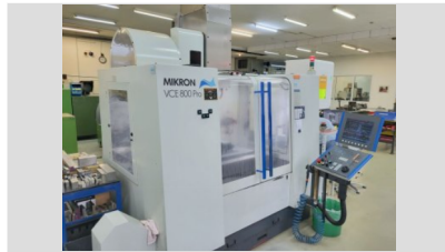
MIKRON VCE 800 Pro 3-axis machining center