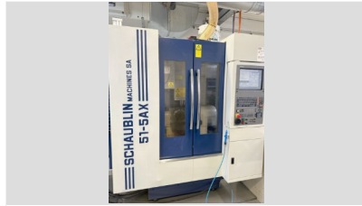
SCHAUBLIN 51 5AX CNC 5-axis machining center