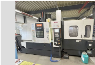
MAZAK NEXUS 510C 3-axis machining center