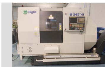
BIGLIA B 545 YS CNC turning lathe