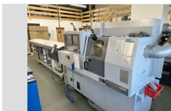
TSUGAMI BS32CE(S)-V CNC automatic lathe