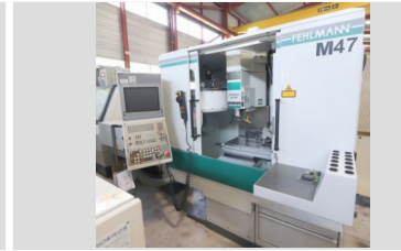
FEHLMANN PM. 60-HSC 5-axis machining center