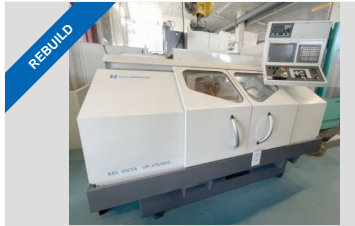
KELLENBERGER KEL-V. CNC cylindrical grinder