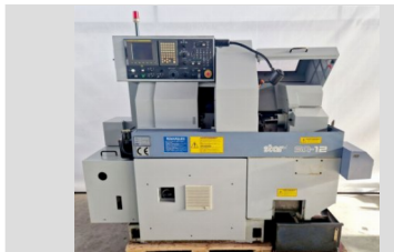
STAR SA-12 CNC automatic lathe