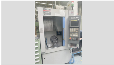
CHIRON FZ 08 KS Magnum 5-axis machining center