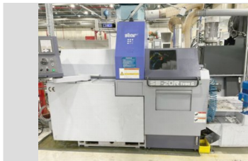
STAR SB-20R type G CNC turning lathe