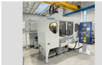
HAUSER S 35-400 CNC jig grinder