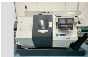
BIGLIA B 465 T2Y2 CNC turning lathe