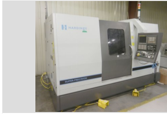
HARDINGE T65 CNC turning lathe