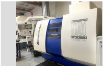
ROLLOMATIC 6000XL Tool & Cutter grinder CNC