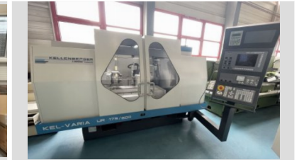
KELLENBERGER KEL-V. CNC cylindrical grinder