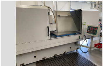
ELB PERFEKT BD Surface grinder