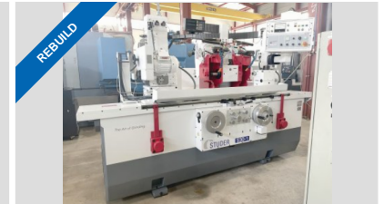
STUDER S 30-1 Cylindrical grinder