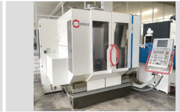
HERMLE C 800 U 5-axis machining center