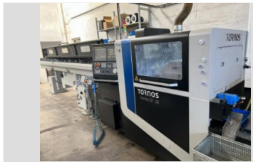
TORNOS DT 26 CNC automatic lathe