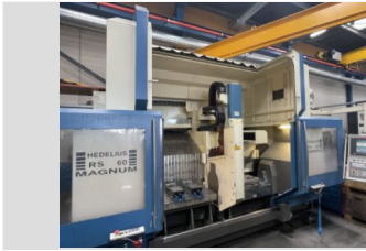
HEDELIUS RS 60 3 + 5-axis machining center