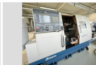
MIYANO BNE-51 S5 CNC turning lathe