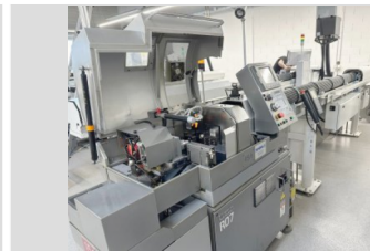
CITIZEN CINC. R 07 VI CNC automatic lathe