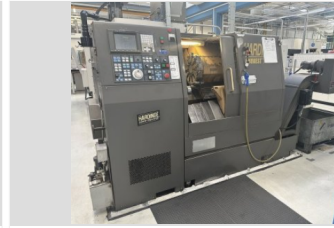
HARDINGE CONQ. T42SP CNC turning lathe