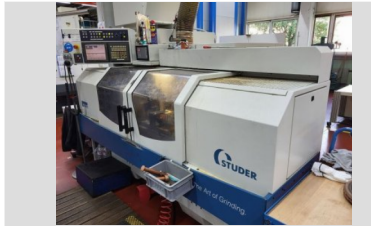
STUDER S 33 CNC CNC cylindrical grinder