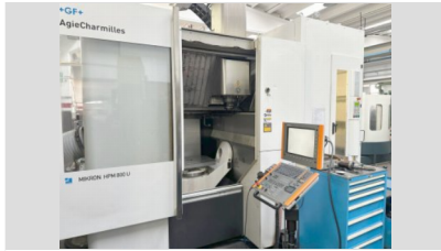
MIKRON HPM 800 U 5-axis machining center