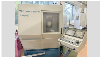
WILLEMIN MAC. W 401S 3-axis machining center