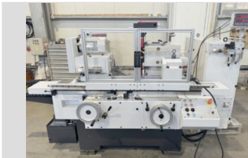
KELLENB. 600 U 175 Cylindrical grinder