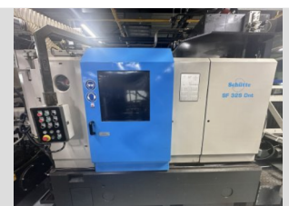
SCHÜTTE SF 32 S DNT Multi-spindle turning lathe