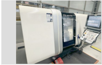
DMG GILDEMEISTER CTX CNC turning lathe