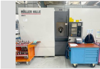
HÜLLER HILLE BLUEST. 5 4-axis machining center