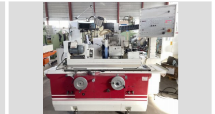
TSCHUDIN HTG 400 Cylindrical grinder