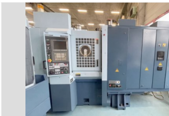
MATSUURA H. PLUS 300 Horizontal machining center