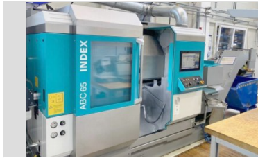
INDEX ABC 65 Turning-Milling-Drilling C.