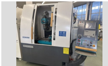
SCHNEEBERGER GEMINI Tool & Cutter grinder CNC