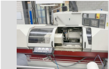
STUDER S 30 LEAN PRO CNC cylindrical grinder