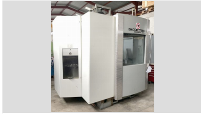
DMG DMC 75 V linear 5-axis machining center