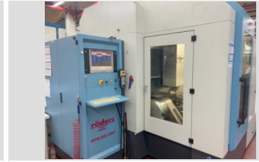
RÖDERS RFM 600 DSP 5-axis machining center