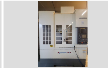
KITAMURA MyCenter-2Xif 4-axis machining center