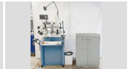
EWAG WS 11 Tool and cutter grinder