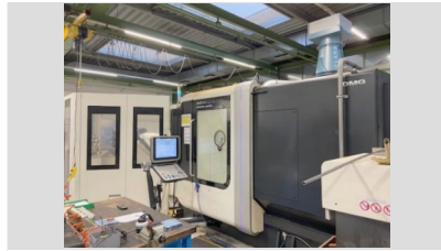
DMG DMC 55H duoB. 4-axis machining center