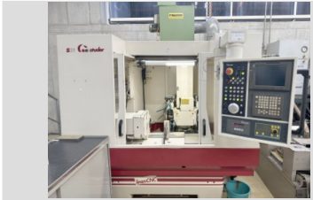
STUDER S 21 LEAN CNC CNC cylindrical grinder