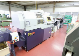
CITIZEN CINCOM L 20 CNC automatic lathe