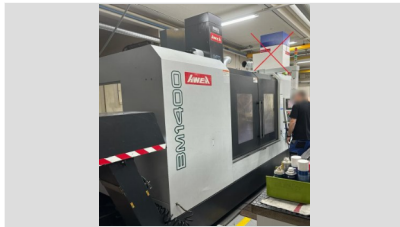
AWEA BM-1400 4-axis machining center