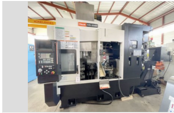
MAZAK IVS 200 M Turning-Milling-Drilling C.