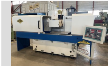
ELB PERFEKT BD 8 SPS Surface grinder