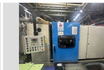
SCHÜTTE AF 51 Multi-spindle turning lathe