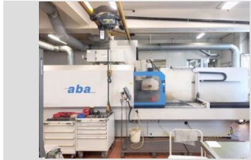
ABA Multiline 2010 Surface grinder