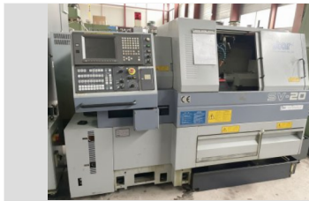
STAR SV-20 CNC automatic lathe