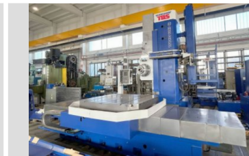
TOS WHN 110 Q Boring and milling machine