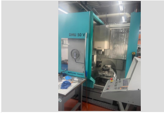
DMG DMU 50 V 5-axis machining center