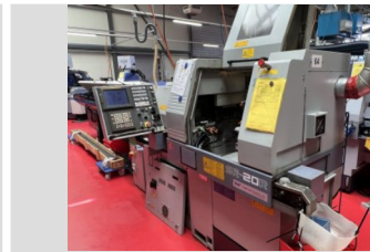
STAR SR-20 R CNC automatic lathe