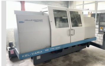
KELLENBERGER KEL-V. CNC cylindrical grinder