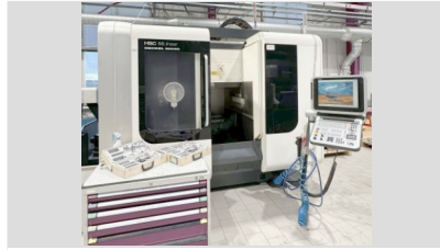
DMG HSC 55 linear 5-axis machining center