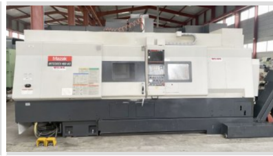
MAZAK INTEGREX 400-3S Turning-Milling-Drilling C.