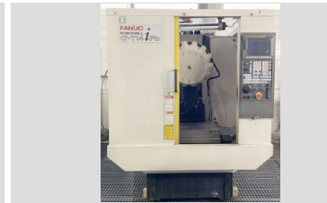
FANUC ROBOD. T14 3-axis machining center