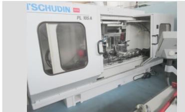
TSCHUDIN PL 105 A CNC cylindrical grinder