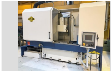
ELB SMART BD10 STC CNC Surface