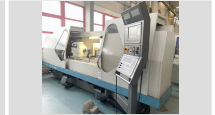
KELLENB. R175x1500 CNC cylindrical grinder