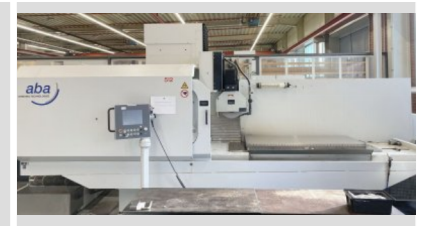
ABA MULTILINE 1507 A Surface grinder