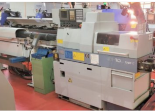
STAR SR-10 J type C CNC automatic lathe