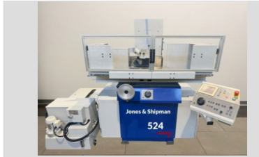
JONES SHIPMAN 524 easy Surface grinder