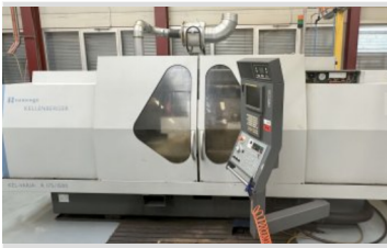
KELLENB. R175x1500 CNC cylindrical grinder