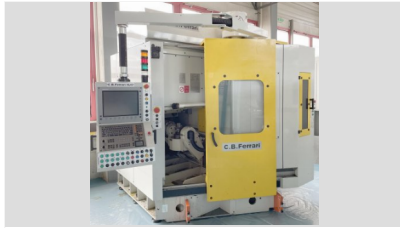
C.B.FERRARI ML 45 5-axis machining center