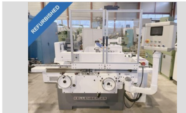
KELLENBERGER 600 U Cylindrical grinder