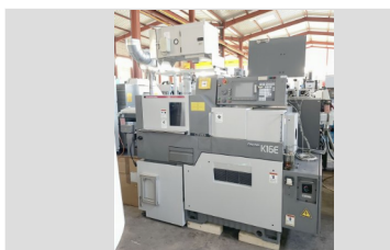
CITIZEN CINCOM K16EVII CNC turning lathe