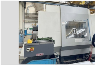
MIKRON HPM 1350 U 5-axis machining center