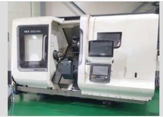
DMG MORI NZX 1500 Turning-Milling-Drilling C.