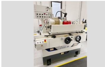
STUDER S 20-2 Cylindrical grinder