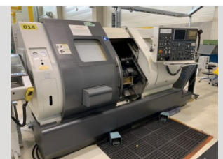
NAKAMURA-TOME WT-150 CNC turning lathe