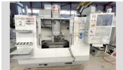
HAAS VF-2 SSHE 3-axis machining center