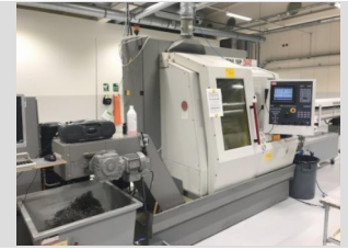
TRAUB TNL 18P CNC automatic lathe