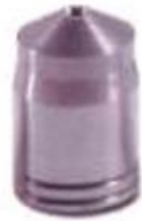
Acier inox Ø 7 mm