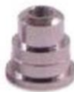
Acier inox Ø 5 mm