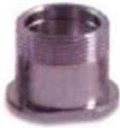
Acier inox Ø 5 mm