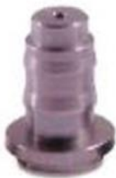
Acier doux Ø 9 mm