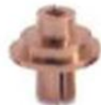
Leiton Ø 6 mm