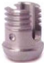
Titane Ø 5 mm