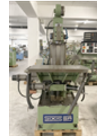
Table length 850 mm Table width 400 mm Longitudinal travel (X-axis) 450 mm Transversal travel (y axis) 350 mm Vertical travel (z axis) 400 mm Spindle speeds: stepless from 50 t/min up to 4000 t/min Taper in spindle 40 ISO Swivel range Vertical milling head 360 ° Feeds 0 - 750 mm/min Rapid traverse: 30 m/min Voltage 50 Hz 3x 380 Volt Spindle motor 6.8 kW Machine's weight about 1550 kg Overall dimensions machine: Length 1700 mm Width 1550 mm Height 2250 mm

Group Vertical milling machine Manufacturer SIXIS Type S 2104