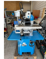
Table length 600 mm Table width 190 mm Longitudinal travel (X-axis) 300 mm Transversal travel (y axis) 135 mm Vertical travel (z axis) 300 mm Spindle speeds: number (steps) 8 from 100 t/min up to 2000 t/min Voltage 50 Hz 3x 380 Volt Motor output 2.0 CV Machine's weight about 620 kg Overall dimensions machine: Length 1100 mm Width 900 mm Height 1600 mm

Group Universal milling machine Manufacturer ACIERA Type F 3