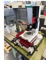
Table length 400 mm Table width 200 mm Measuring range: longitudinal 150 mm transversal 100 mm Magnification: from 20 x Nonius turnable 360 ° Digital readout number of axis: 2 Longitudinal travel 150 transversal travel 100 Machine's weight about 30 kg Overall dimensions machine: Length 700 mm Width 500 mm Height 700 mm

Group Measuring microscope Manufacturer ISOMA Type M 215